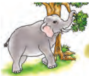
Elephant eating leaves

9. The elephant has a long trunk which it uses like a hand. It picks up food with it and puts it into its mouth. It also drinks water with it.